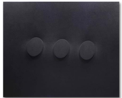
Turi Simeti 3 ovali neri sovrapposti, 2018 Acrylic on shaped canvas 100 x 120 cm © Studio Turi Simeti Courtesy Walter Storms Galerie