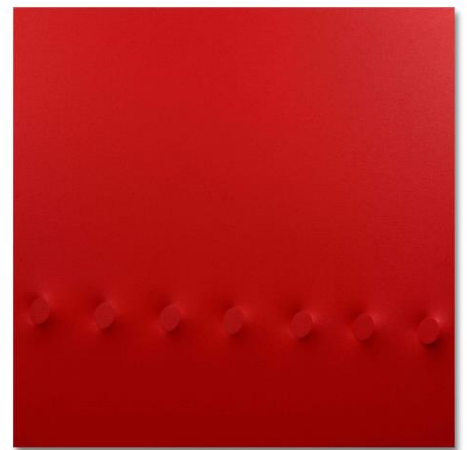
Turi Simeti 7 ovali rossi , 2017 Acrylic on shaped canvas 80 x 80 cm

Long stays in London, Paris and Basel followed, where Turi Simeti met numerous representatives of the contemporary avant-garde. Inspired by his travels and the desire to free his art from the traditional and previously established codes, Simeti decides in the early 60s to use the monochrome and the relief as pictorial elements. The ellipse becomes his trademark and code of his artistic work. The relief-like elevations achieve a unique, three-dimensional effect thanks to their interplay of light and shadow. This impression is reinforced by the monochrome color scheme white, blue, red, green, black or yellow. He gives his paintings