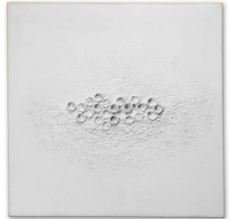
Günther Uecker Struktur, 1958 Acrylic and paper maché on canvas 100 x 100 cm