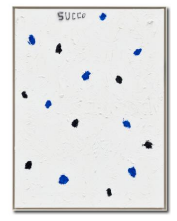
Chris Succo Spark Painting (SP2305), 2023 Oil and varnish on canvas, artist frame 111,8 cm x 111,8 cm