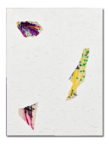
Chris Succo Flake, 2023 Oil and varnish on canvas, artist frame 213,36 cm x 160,02 cm

In the impasto application of white paint on canvases previously primed with spray paint, Succo found an idiosyncratic stylistic device that also characterizes his latest White Paintings in this exhibition. We can detect a material kind of tension in these works. It unfurls between the thinly coated background and the white surface, which is densely populated by swiftly applied layers of brushwork. While color is often the decisive factor for the atmospheric dynamics in a pictorial structure, Succo's White Paintings counteract this premise by using white to deliberately restrain the impact of color. The colorful canvas background is transformed into a subtle undertone supporting the gestural, dynamic painting surface, which is further accentuated in certain areas by the use of paint squeezed directly from the tube.